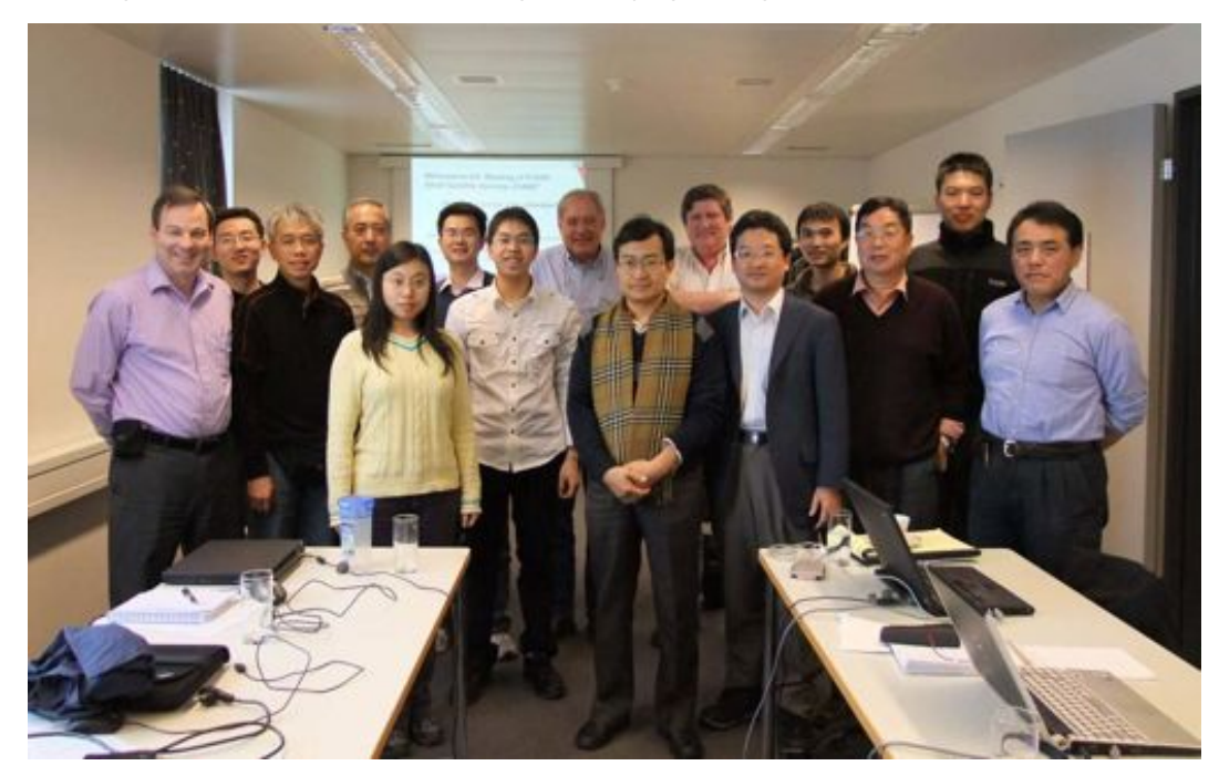
在清华大学强子应用及技术中心的倡议下,国际微型加速器驱动中子源联盟(UCANS)成立。目前 起始成员包括美国印第安那大学、日本高能加速器研究机构 KEK、日本北海道大学、日本京都大学、 日本理化学研究所、北京大学及清华大学七所院校,协调人为美国 Argonne 国家实验室的 J. Carpenter 和清华大学龙振强教授。上图为各成员组织代表在瑞士苏黎世聚会时的合影。首届 UCANS 会议将 于今年 8 月在北京清华大学举行。

The June 2009 International Mini-Workshop at Tsinghua not only kicked off the CPHS Project but also fermented the notion of cooperation among compact-neutron-source enthusiasts at many places in the world. Our exchanges with Indiana (USA), Hokkaido and Kyoto (Japan), and KAERI (Korea) in the past months have reinforced such idea. Propitiously the ICANS-XIX in March 2010 at Grindelwald, Switzerland offered an opportune occasion to consolidate an alliance, and in a satellite meeting in Zurich on March 13 organized by HATC-Tsinghua, we celebrated the establishment of the Union for Compact Accelerator-driven Neutron Sources (UCANS). The seven initial members—those in attendance—are: from the USA Indiana University, from Japan the High Energy Accelerator Research Organization (KEK), Hokkaido University, Kyoto University and RIKEN, from China Beijing University and Tsinghua University, with additional potential members from Argentina, Korea, Germany and elsewhere. Jack Carpenter of Argonne National Laboratory will serve as a spokesman of UCANS. In view of the actively ongoing works on accelerators, target-moderators, instruments and optics, all members felt a genuine need for frequent meetings. Certainly, UCANS is not exclusive of but actually complementary to ICANS. The first meeting is scheduled to be held at Tsinghua, Beijing in August 2010.